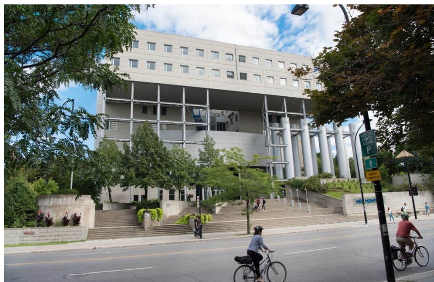
HEC Montréal—Campus Côte-Sainte-Catherine